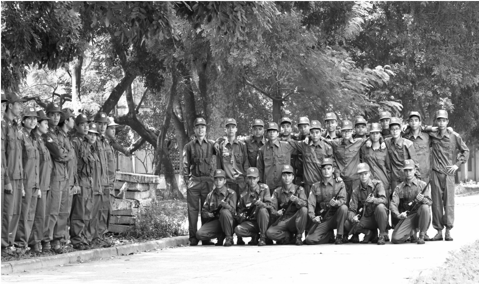
Students of National Defense and Security at Bac Ninh Sports University

the years, due to the difficulty of enrollment of associating units.