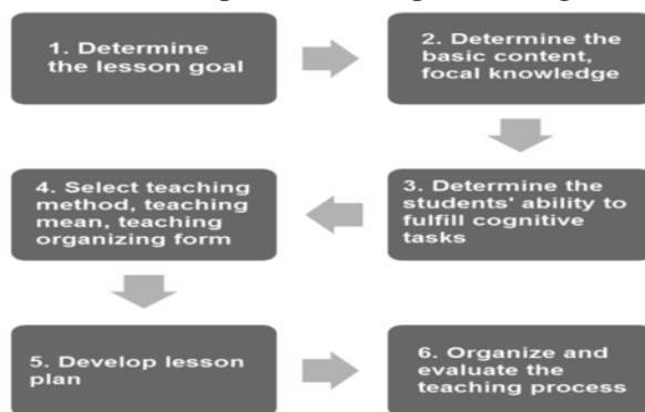
Diagram 1. The process of developing lesson plans using Chessbase 9.0 software in teaching Opening for chess students in physical education department at Bac Ninh Sports University

From the teaching reality, the results of the analysis and synthesis of common and professional material resources, we create a preparation process using technology with the steps to design a lesson plan and the structural framework of a specific lesson plan as diagram 1.