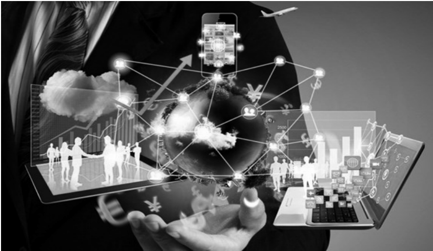
Science and technology are of particular importance in the current context

cooperation ... of officials, public servants and employees of the sports division and has also served the professional activities of the division through application software., however, some issues still exist such as: The deployment of IT applications is still asynchronous; linking and sharing data are not highly effective, outdated technology system, which makes it difficult to meet the demands, and especially, leaders of some units have not seriously considered the application of IT in management and administration.