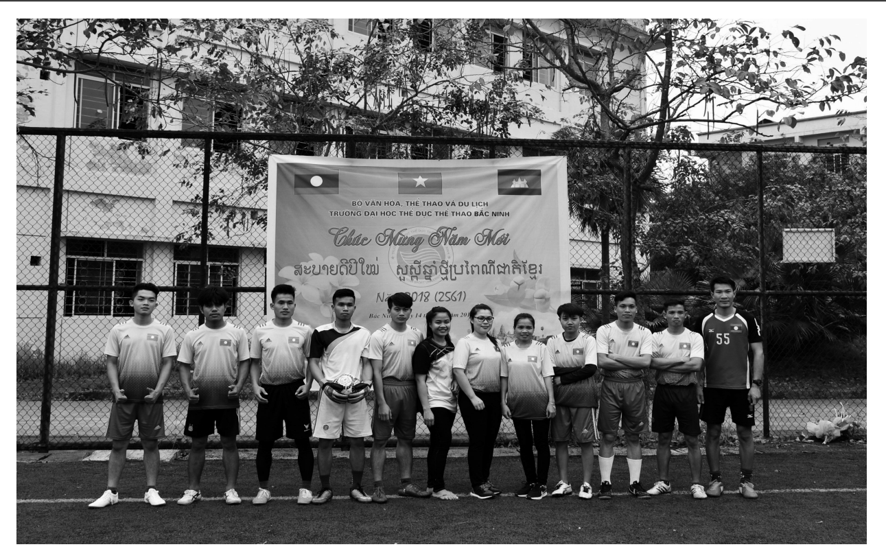
Laos-exchange students are learning to improve their qualification at Bac Ninh Sports University